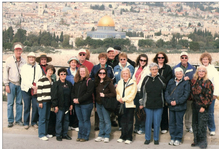
Olive Branch Mission Tour 2010. Mt. of Olives overlooking Mt Moriah. (The Temple Mount)